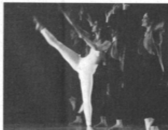
Human Nature is Ecotopia in action. — Earnest Callenbach Author, Ecotopia